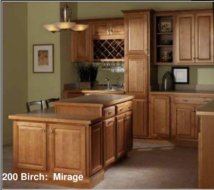
200 Birch: Mirage