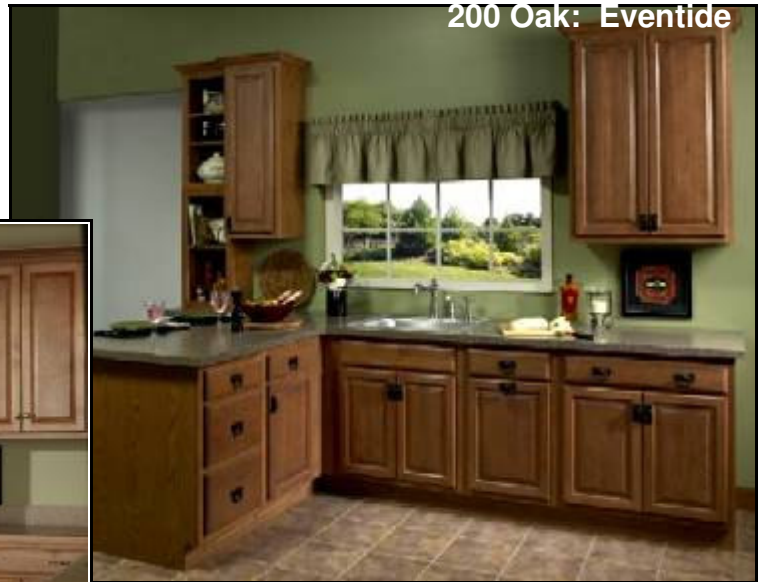
200 Oak: Eventide