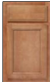
Mirage w/ Mocha