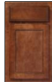
Clove w/ Licorice