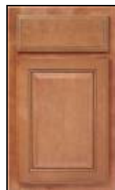
Mirage w/ Mocha