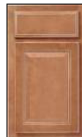
Mirage w/ Vanilla