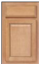
Dawn w/ Mocha