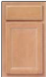
Dawn w/ Vanilla