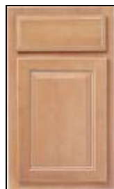
Dawn w/ Vanilla