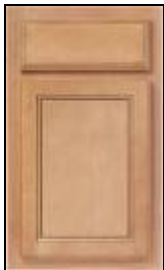
Dawn w/ Mocha