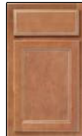
Mirage w/ Vanilla