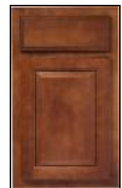
Clove w/ Licorice